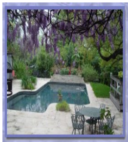
Chicken Paradise Bed and Breakfast, San

Recently my husband and I travelled to San Antonio, Texas for the Big 12 Championship game. We stayed at the Chicken Paradise Bed and Breakfast in San Antonio, a place I remembered seeing online and reading good reviews. Our expectations were greatly exceeded!